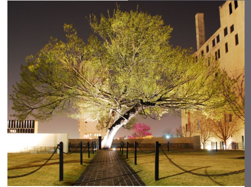
Survivor Tree Oklahoma City Bombing Memorial

In the event of a loved one's death... immediate decisions must be made.